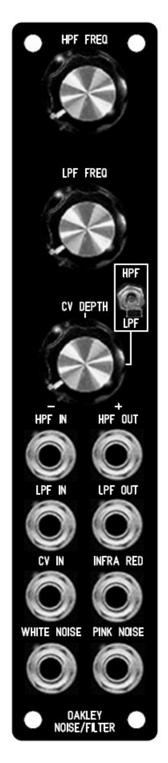
The suggested panel layout for the MOTM format of the Oakley Noise/Filter module.