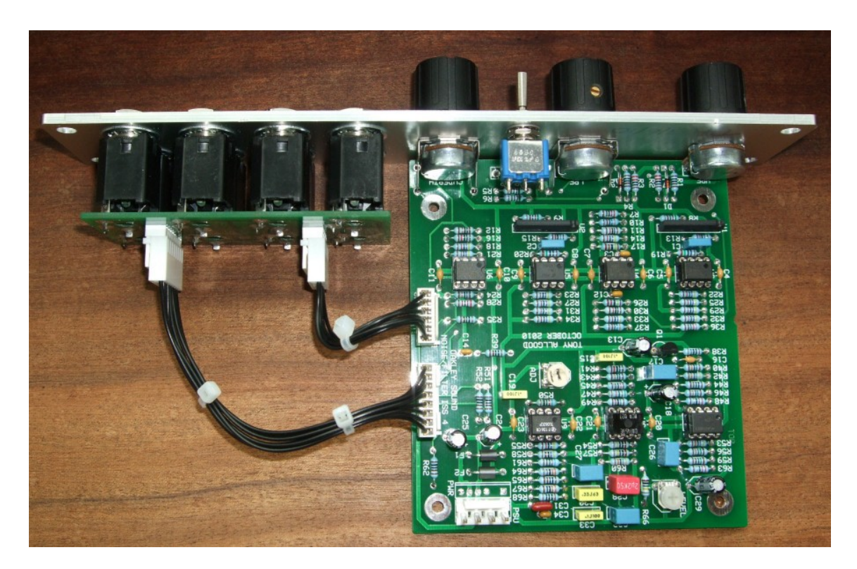
The issue 4 PCB mounted behind a 1U MOTM format Schaeffer panel in natural finish. Note the use of the Sock8 board to make easy the complicated socket wiring.

I have provided space for the three main control pots on the PCB. If you use the specified 16mm Alpha pots and matching brackets, the PCB can be held firmly to the panel without any additional mounting procedures. The pot spacing is 1.625" and is the same as the vertical spacing on the MOTM modular synthesiser and most of our other modules.