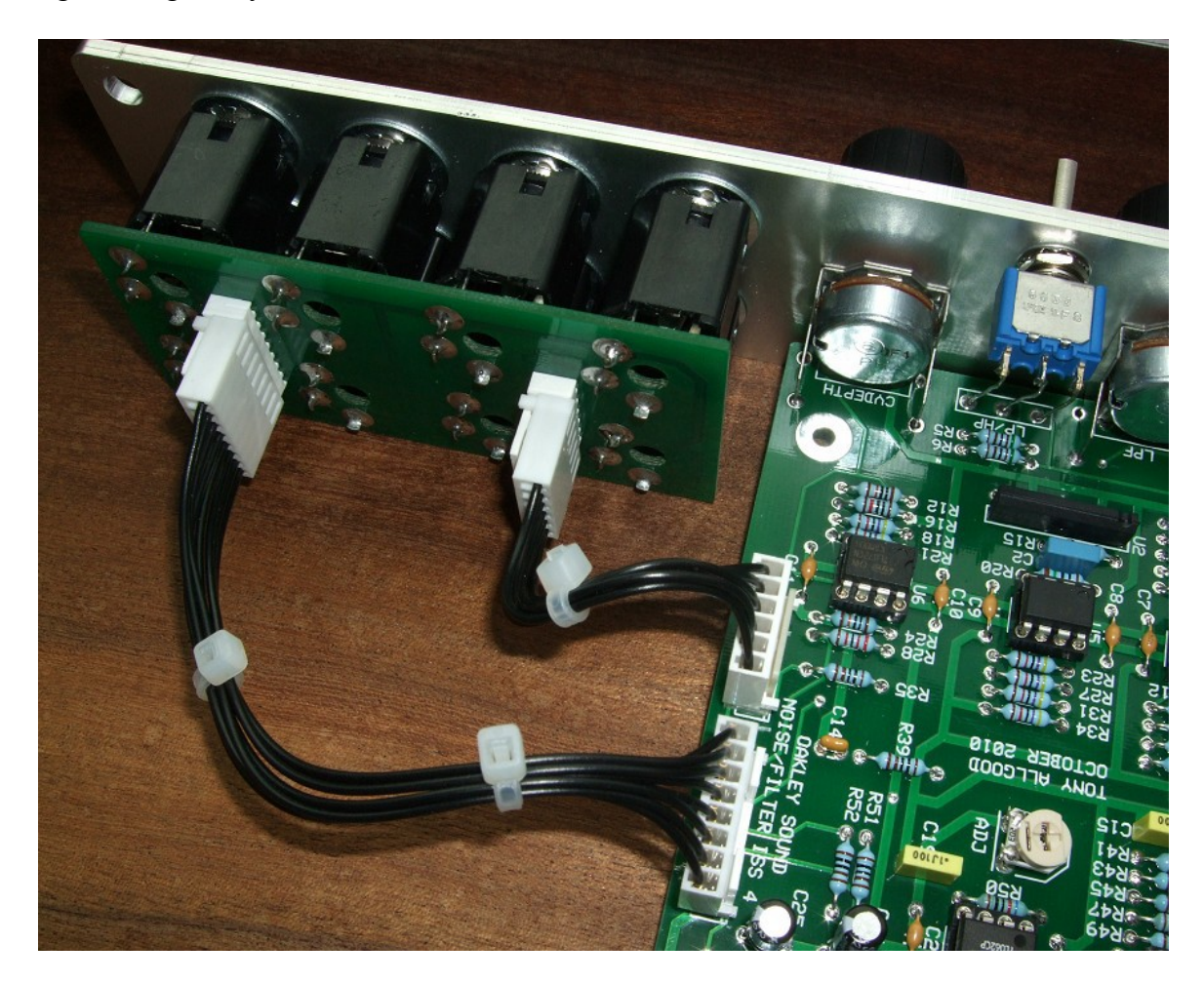
The prototype Noise/Filter module showing the detail of the board to board interconnects. Here I have used the Molex KK 0.1" system to connect the Sock8 to the main PCB.

You need to make up two interconnects. The six way one should be made so that it is 80mm long. The eight way should be made to be 130mm.